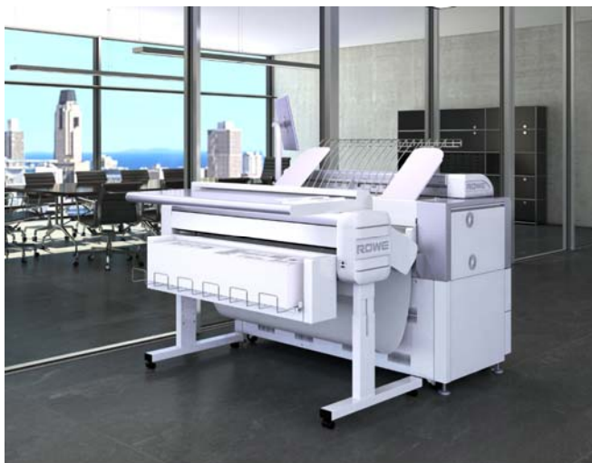
Illus.1: The VarioFold Compact online is compatible with any standard wide format printer.