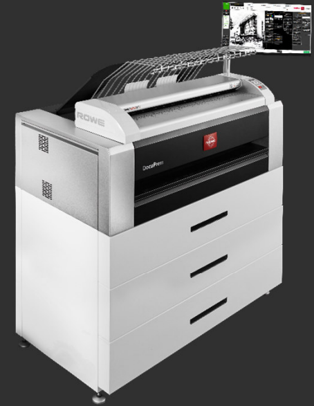
ROWE DocuPress i10L