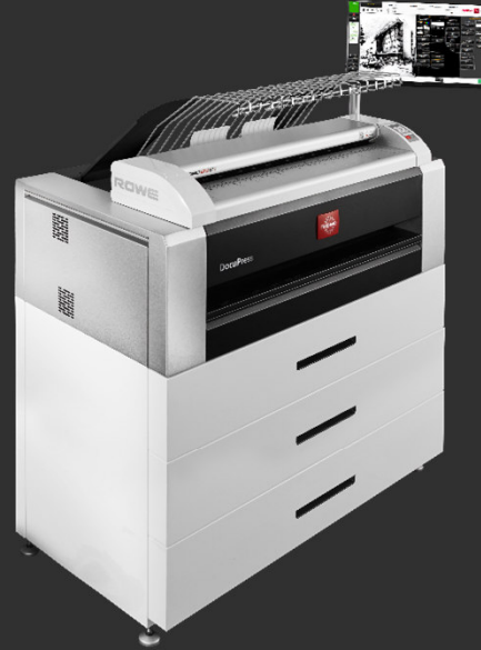
ROWE DocuPress i8L