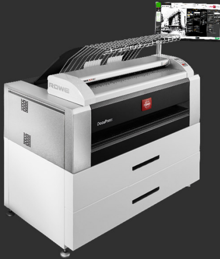
ROWE DocuPress i10